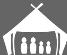
4 PERSON SAFARI