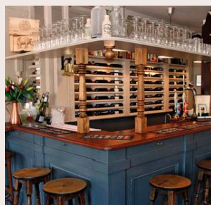
The award-winning Richmond Arms, West Ashling

Purchases Restaurant and Bar, Chichester 01243 771444 P0191LY