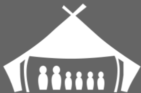
6 PERSON SAFARI